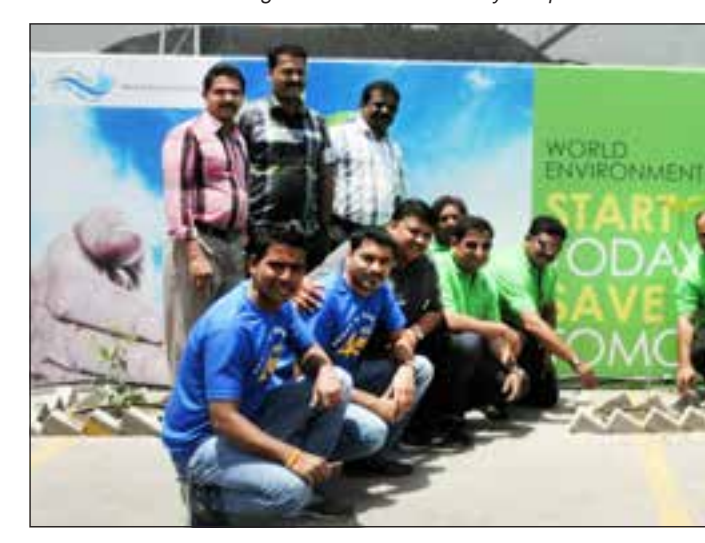
■ Employees of Al Rashid Group marked World Environment Day initiative was aimed at spreading awareness of preserving the env Above, company employees