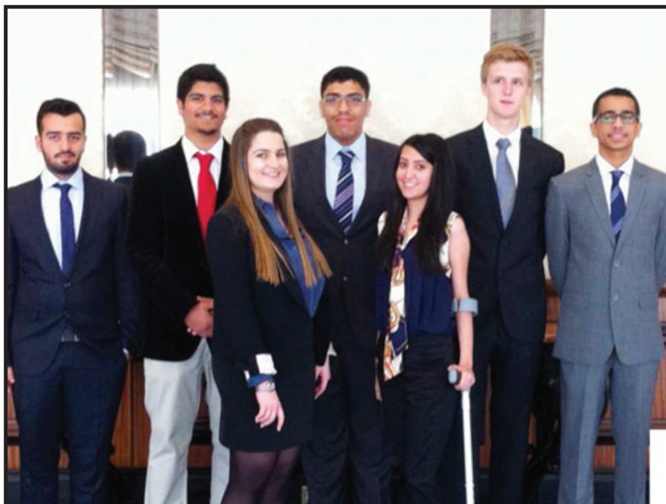
TradeQuest team of St. Christopher's School

The British School of Bahrain (BSB) Year two students were treated to a taste of luxury during an exciting trip to the Kempinski Grand and Ixir Hotel. The students had the opportunity to see all the important behind-the-scenes jobs necessary for the smooth running of a top class hotel. They tried their hands at cookie baking in the kitchens, chilled in the walk-in freezer and saw how the hotel laundry worked.