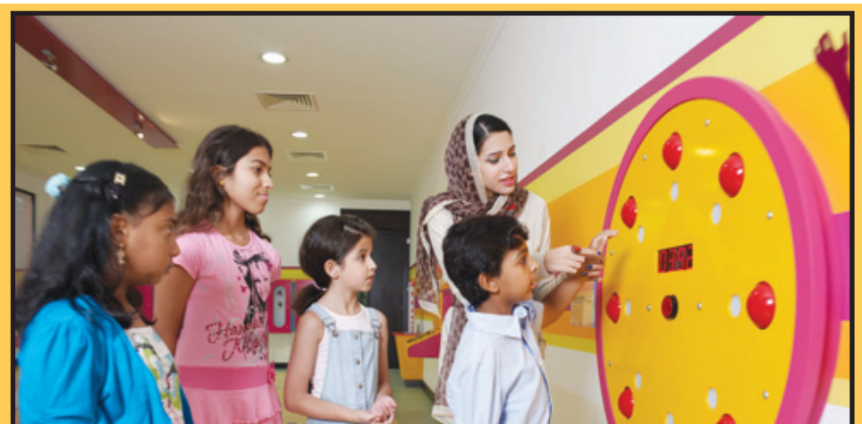
Children at the Brain and Memory exhibit at Bahrain Science Centre