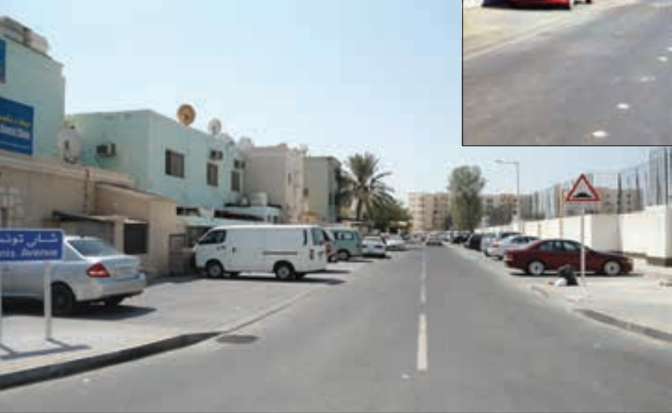
■ Many roads have been revamped

Work comprised expanding the avenue into three lanes in each direction, installing