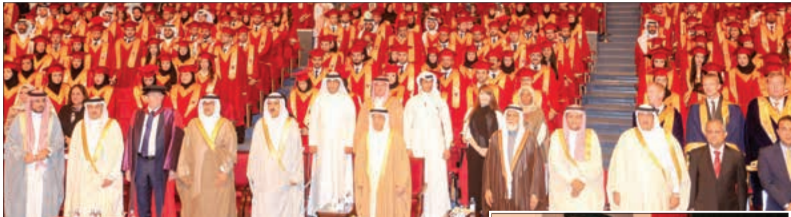
■ Shaikh Mohammed with other dignitaries at the event. Right, a student receives her certificate