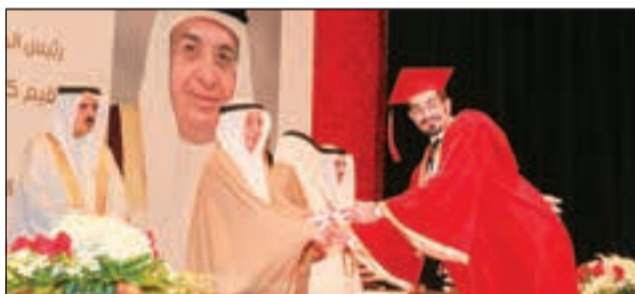
■ A graduate is honoured at the ceremony