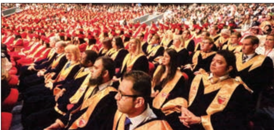
■ Polytechnic students at the graduation ceremony