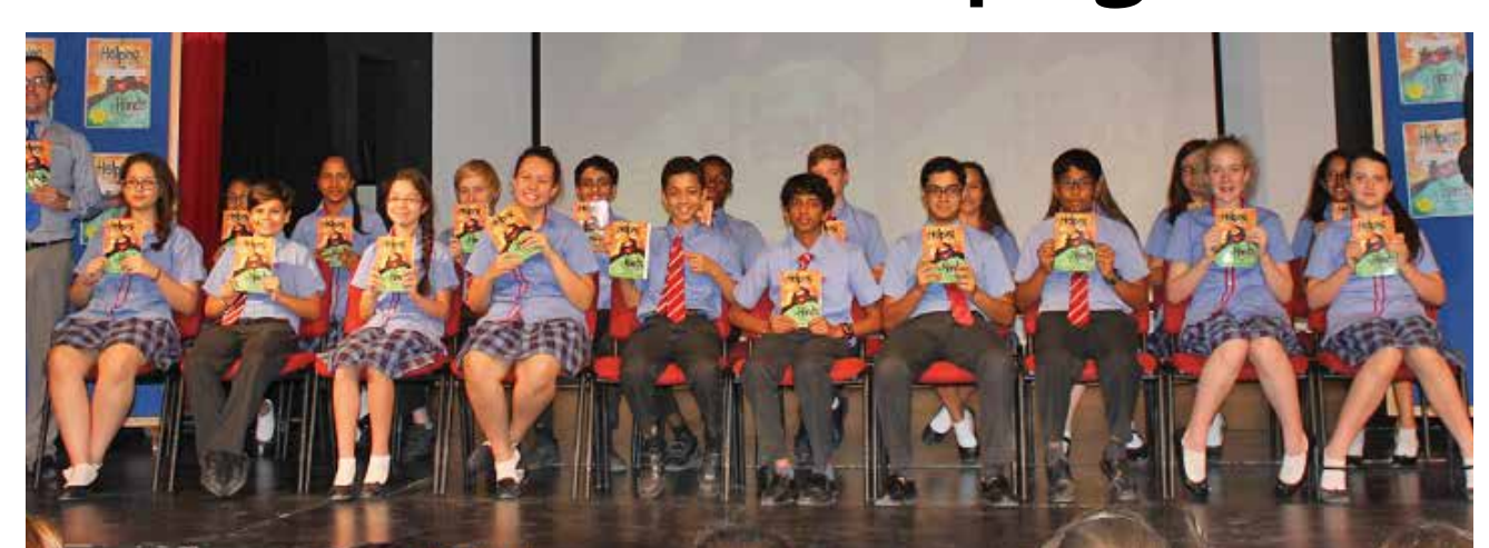
During the launch of "Helping Hands"

The funds raised have been used to build the school, including a library, and to provide clean water and teaching resources for 200 students and their teachers. The building work began in October 2016 and the school officially opened to students in May 2016.