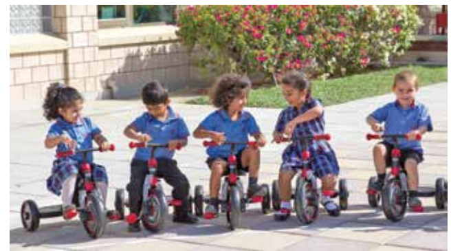
The pre-registration will open online on August 29

Due to a large number of Nursery applications, St Chris has introduced an online 'pre-