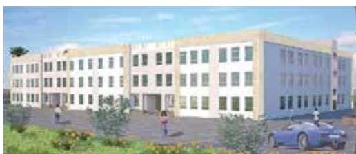
Artist impression of the AMAISB expansion

The major, visible elements of the plan include a new building with complete highly technological facilities such as smart boards, OHPs, CCTV Security System to name a few. It will contain 100 classrooms to be added exclusively for Middle and High School students. The main and existing building will house the