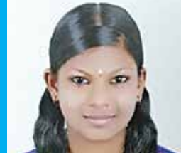
Lakshmi CR 7U The Indian School Kingdom of Bahrain