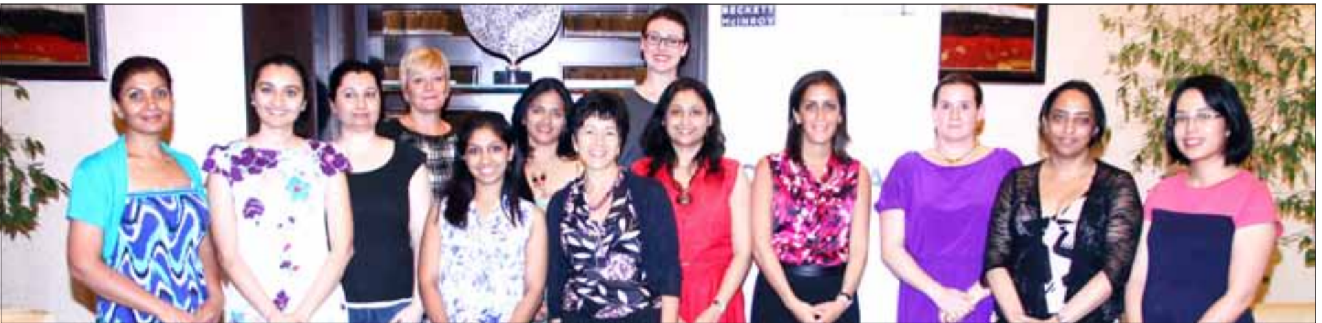
■ Members of Bahrain-based businesswomen's networking group Biznet held an event at Al Areen Palace Hotel and Spa in Sakhir. More than 20 members and guests took part in the evening, which included a business-focused presentation and a spa treatment at the hotel's hydrothermal garden. Above, Biznet members and guests at the event.