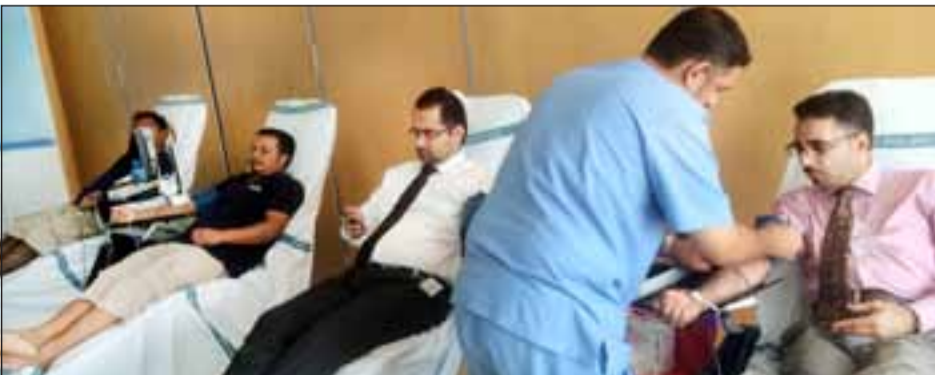
■ More than 50 employees and members of the public took part in Wahooo! Water Park's annual blood donation drive at its premises in Bahrain City Centre. The event was supported by the Health Ministry. Medics from various hospitals were present to offer help during the event. Above, the blood donation drive underway.