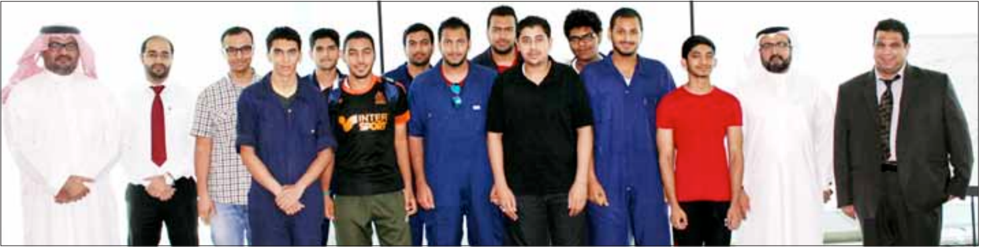
■ Students from Shaikh Abdulla Secondary School have visited the Khaleeji Commercial Bank (KHCB) as part of training programme Job Shadow by youth-centred organisation inJAz. They were welcomed at the branch in Bahrain Financial Harbour and briefed on its operations and services. Above, the students with KHCB officials.