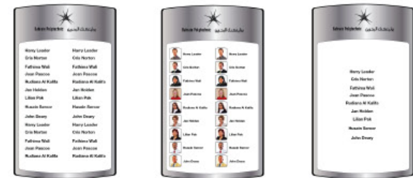
Department Listing Sign