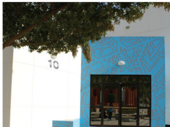
Building Number Sign