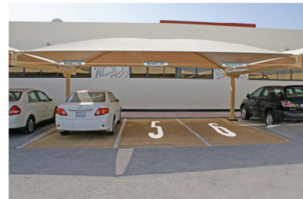
Car Park Sign