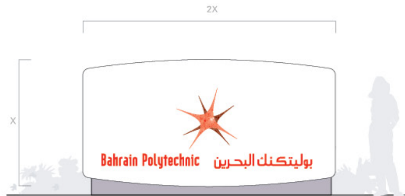
Basic Facility Signage

Various formats are illustrated over the following pages.