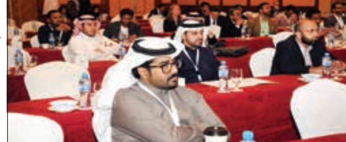
■ Delegates at the conference