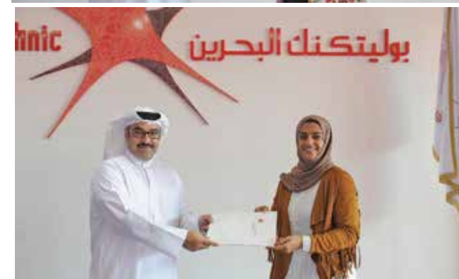
Glimpses from the ceremony