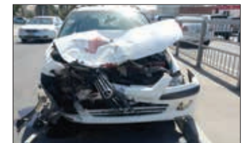
■ A Bahraini youngster was injured in a road accident yesterday. It happened at 1.30pm on Budaiya Highway. He smashed into two cars driven by Bahrainis, after one of them jumped a traffic signal. He was taken to Salmaniya Medical Complex with multiple injuries, reports our sister paper Akhbar Al Khaleej.