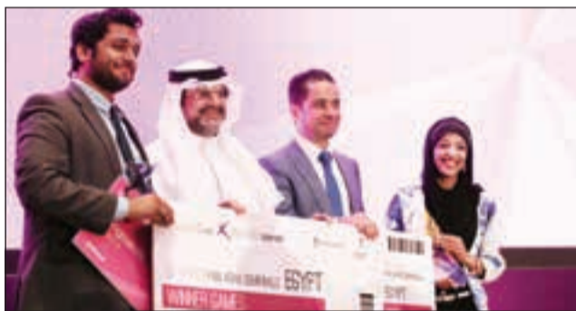
■ Vanguards and, below, UOB Smart Trash team with their prizes

Teams of a maximum of four members were allowed to register until the end of last month in each category with a panel deciding on the best to represent Bahrain at the world finals next month in Cairo.