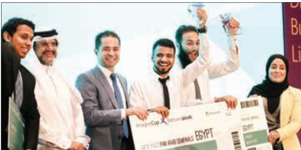
■ Team Spectra with their prize