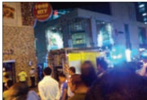
■ People gather outside the restaurant. Right, smoke billows from the building

Ten workers and three customers fled to safety. The Interior Ministry is investigating the incident.