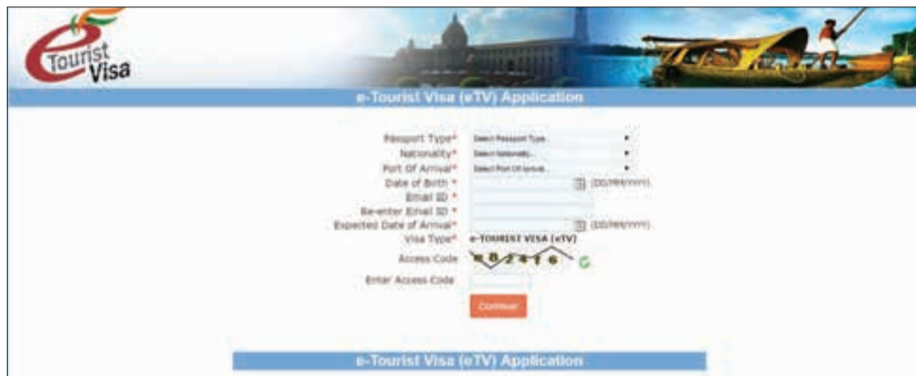
■ A screenshot of the Indian e-tourist visa website ... Bahrainis will soon be able to use the service

"India has always been a popular destination with close