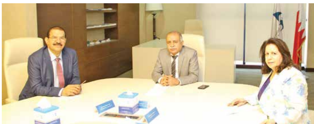
The meeting discussed many resolutions and recommendations.

The committee discussed a proposal to hold a seminar in the fourth quarter of this year on sustainable development goals (SDGs) to shed light